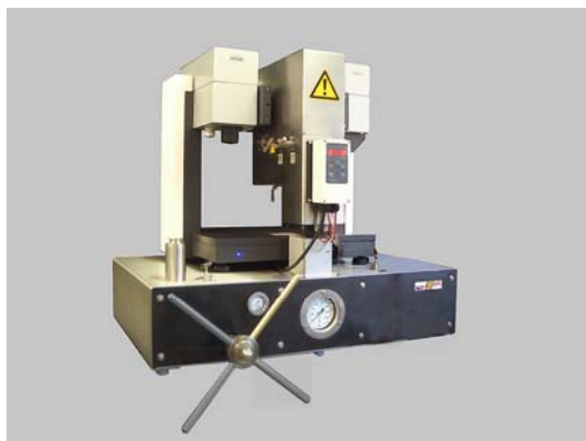
HP3230 with KRÜSS DSA100

The High Pressure View Chamber HP3230 is designed to operate in combination with the KRÜSS DSA100 system and allows the determination of surface tension (pendant drop and rising bubble) and contact angles of fluids in the parameter range from vacuum to 69 MPa (10,000 psi) and 180°C (350°F). Additionally, the device enables the scientist to visually observe the material behavior under these extreme conditions. Observation of e.g. solidification or swelling behavior can lead to valuable insights about the system properties.