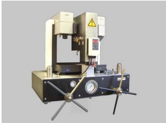
HP3230LL with KRÜSS DSA100

The High Pressure View Chamber HP3230LL is designed to operate in combination with the KRÜSS DSA100 system and allows determination of surface tension (pendant drop and rising bubble) and contact angles of gas-liquid or liquid-liquid systems in the parameter range from vacuum to 69 MPa (10,000 psi) and 180°C (350°F). Additionally, the device enables the scientist to visually observe the material behavior under these extreme conditions. Observation of e.g. solidification or swelling behavior can lead to valuable insights about the system properties.