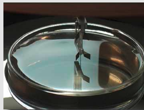
Contact angle measurement on a single fibre

The wetted length of each fibre can also be determined automatically. This requires an additional laser-scan micrometer, which measures the diameters of all the fibres in the storage cassette – with an accuracy \leq 1 \mu\text{m} . The results are transferred to LabDesk and used for the subsequent contact angle measurement series.