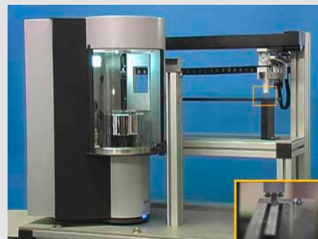
K100SF with sample loading system